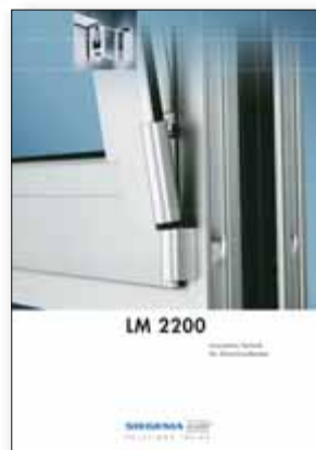
LM 2200 Innovative technics for Aluminium windows