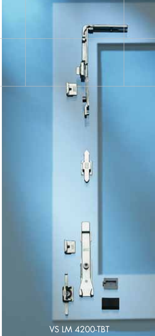
VS LM 4200-TBT