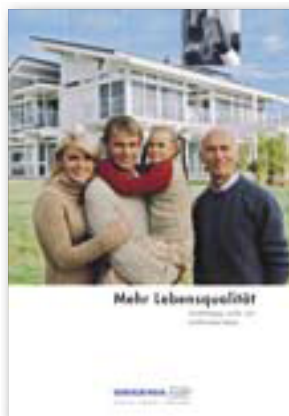
Better quality of life independant safe and comfortable living