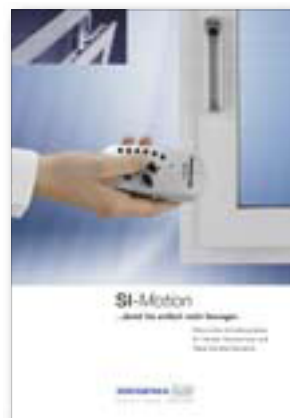
Si-Motion This simply moves more