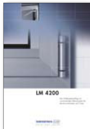
LM 4200 The tilt/turn fittings with the intigrated clamping system for Aluminium-Windows and Doors