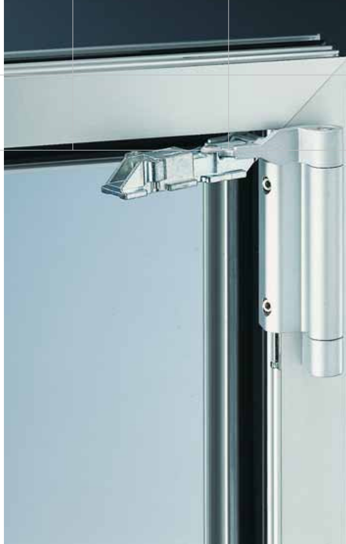
LM 4200 turn only hardware