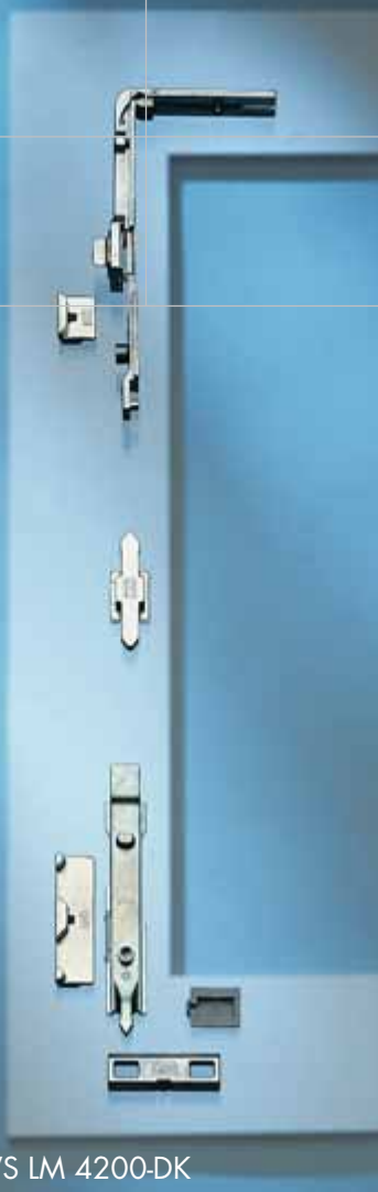
VS LM 4200-DK Locking side - tilt and turn