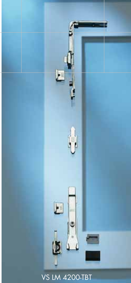
VS LM 4200-TBT Locking side - tilt before turn