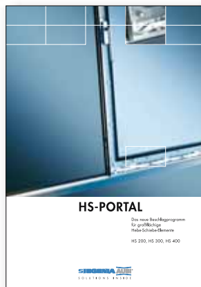
HS Portal The new hardware programme for extensive tilt and slide elements HS 200, HS 300, HS 400