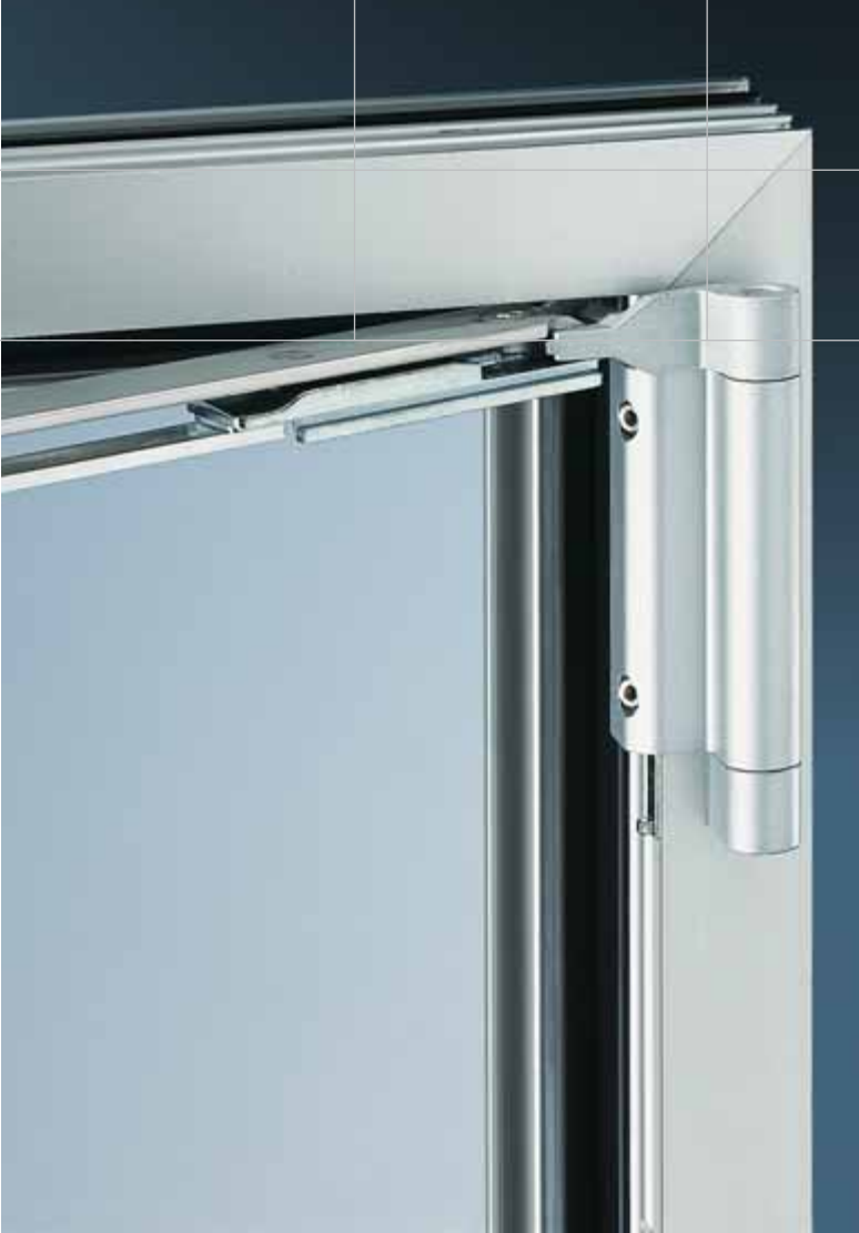
LM 4200 tilt and turn hardware