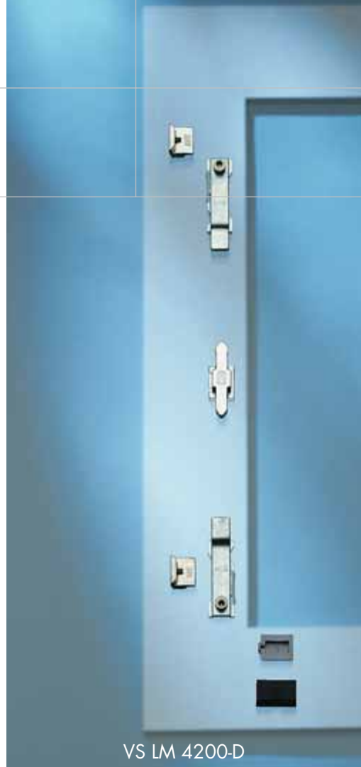
VS LM 4200-D Locking side - tilt only