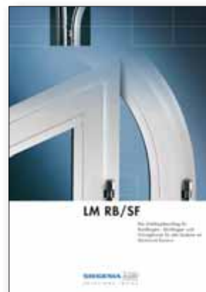
Rounded head windows LM RB/SF The tilt and turn hardware for rounded head, arched head and angled head window for all systems with Aluminium Eurogroove