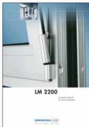
LM 2200 Innovative technics for Aluminium windows